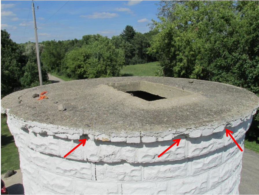
Photo 2: Silo Cap w/ Rectangular Opening (Arrow Points to Missing Brick)